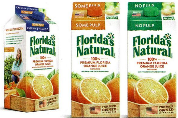
Design Firm: LAM Design, Pleasantville NY Client: Citrus World Title: Florida's Natural Orange Juice Redesign